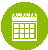
Annual Leave Payouts

Scenario 1: A local school district's leave policy allows employees to accumulate up to 120 hours of leave. Any hours accumulated over the 120-hour limit are paid out to the employee each June.